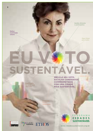
Advertisement: Agência DPZ