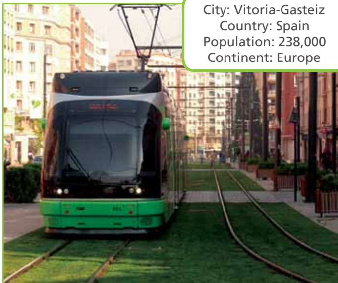
City: Vitoria-Gasteiz Country: Spain Population: 238,000 Continent: Europe

For cities with less than 50,000 inhabitants a different number of indicators is recommended. General indicators can be incorporated into basic indicators for those who wish to further the process of monitoring public policies aiming at sustainability.