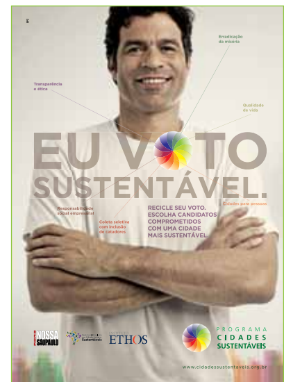
Advertisement: Agência DPZ